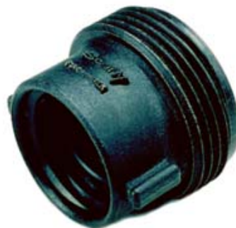
4082 Reducer Changes 1-1/2" thread down to 1".