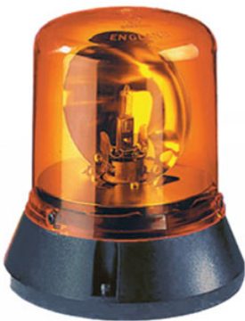
Centre Bolt Mount: 321-00