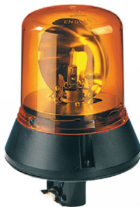
Pole Mount: 322-00