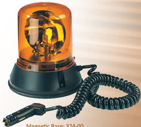
Magnetic Base: 324-00

“Quality and Innovative Fire and Rescue Equipment”