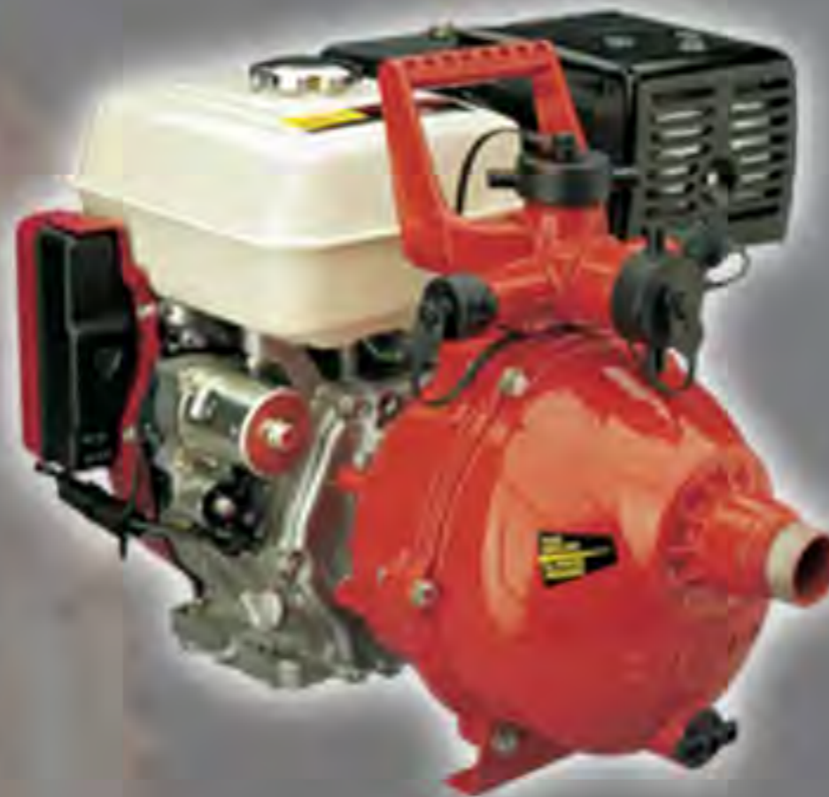
Davey Firefighter Pump Twin Stage - 3 Way Outlet