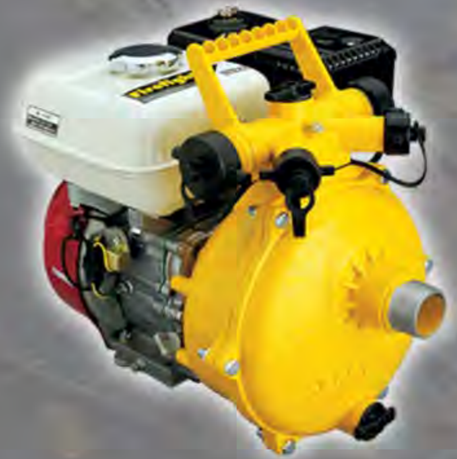
Davey Firefighter Pump Single Stage - 4 Way Outlet