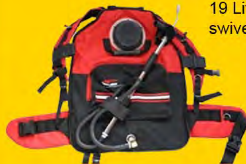
Vallfirest Knapsack 19 Litre with 360° swivel outlet

The 4 Litre features a fixed wand however the 5 Litre is fitted with a retractable wand, providing easy to use transportation and storage ability.