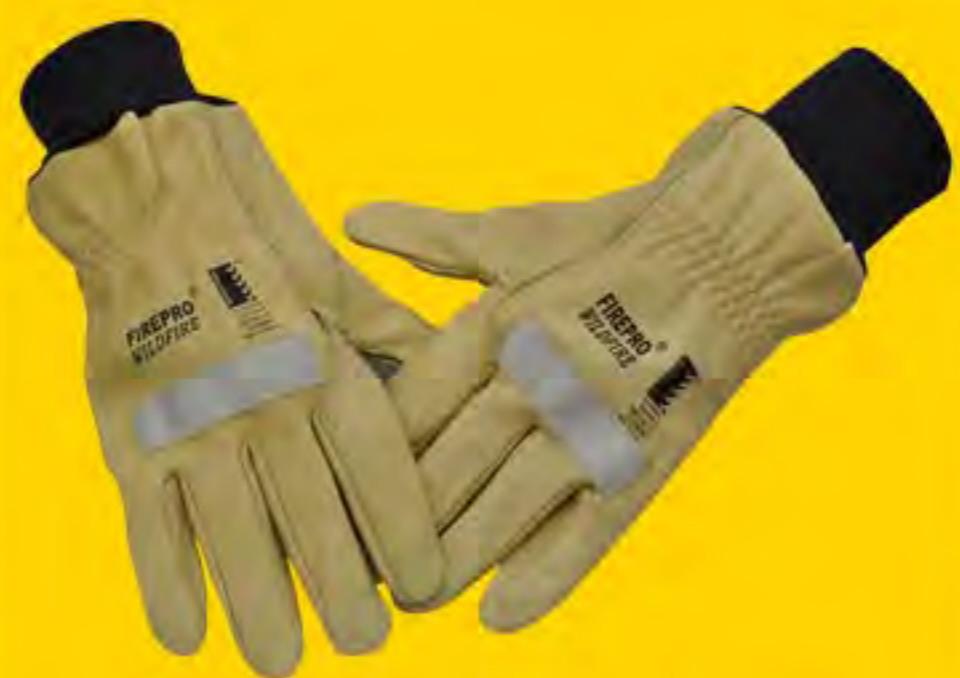
Firepro Wildfire Glove