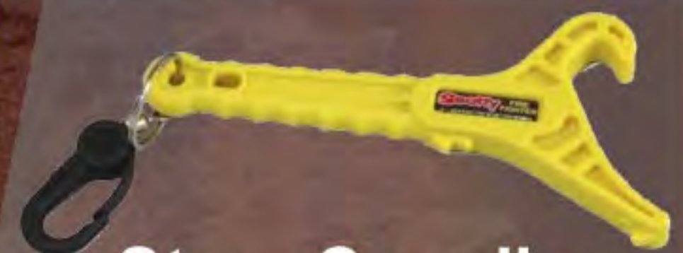
Storz Coupling Spanner