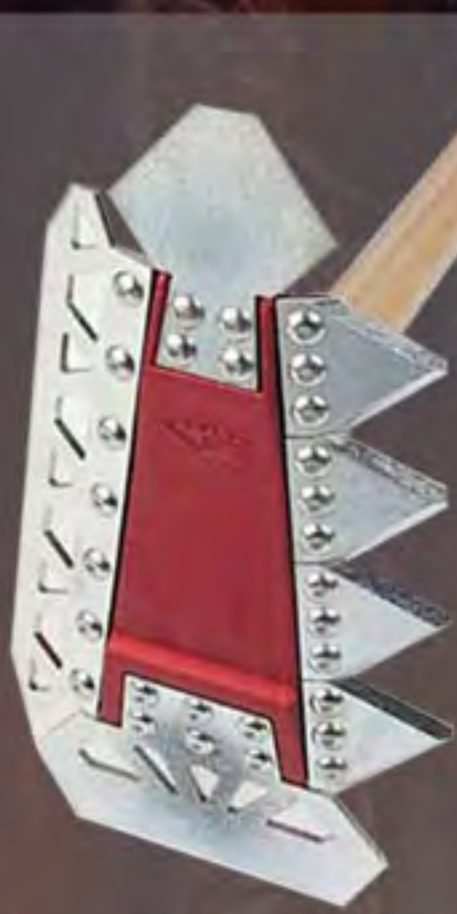
Gorgui Tool 4-in-1

Now available with removable handle, the Vallfirest "Gorgui" rake hoe multi-functional tool has a central head of aluminium alloy that includes a large blade McLeod tool with increased height and hardened steel Hoe blade!