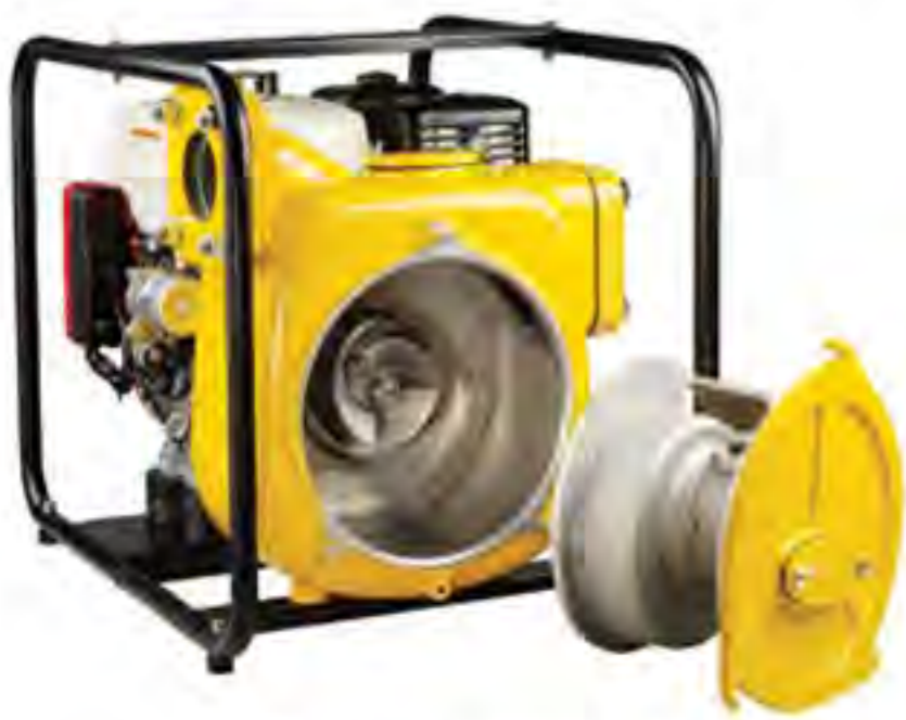
Davey Flood Fighter

Get it right, and your Davey Fire or Flood Fighter pump will deliver and perform every time!