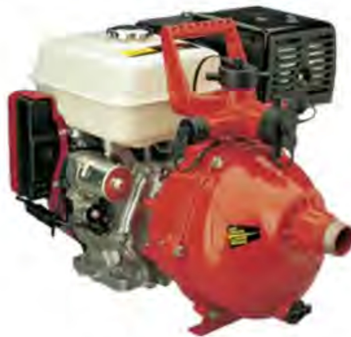
Davey Fire Fighter