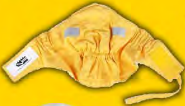
Smoke Mask + Filter