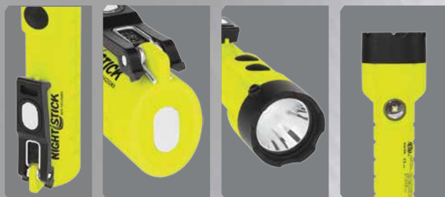
Built in pocket/ belt clip with integrated magnet