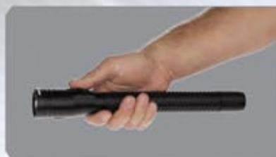
Two body switches