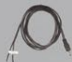
Direct wire kit