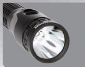
High-efficiency deep parabolic reflector