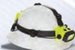
Rubber hardhat strap included