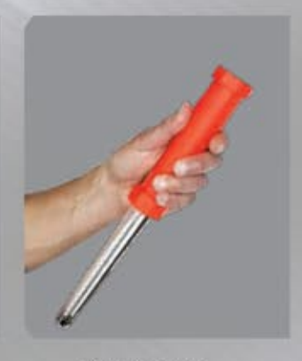
Using the spotlight