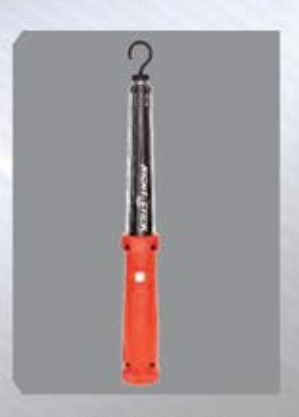
Magnet on top with removable hook