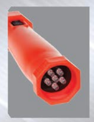
6 LED Spotlight