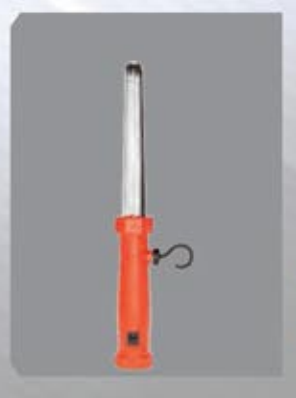
Magnet on body with removable hook