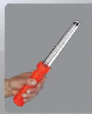
Using the floodlight