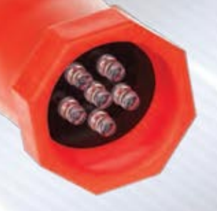
6 LED Spotlight