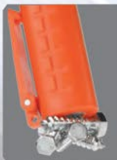
Hands-free magnet in base