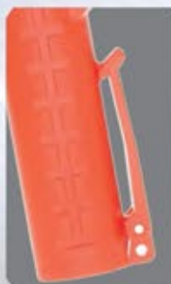
Built in pocket/belt clip