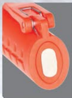
Integrated magnet built into the handle