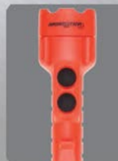
Dual body switches