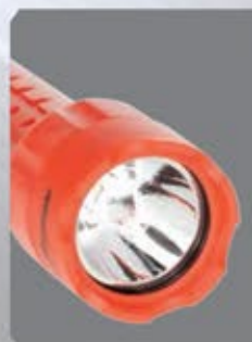
High-efficiency deep parabolic reflector