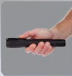
Body switch (NSR-9512B/12Y/14B)