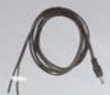
Direct wire kit

*Limited Lifetime Warranty • Product is warranted to be free from defects in workmanship and materials for the lifetime of the original owner. Includes the LEDs, housing, lenses, electronics and switches. Rechargeable batteries and chargers are warranted for a period of one year. Excludes normal wear and abuse.