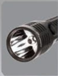
High-efficiency deep parabolic reflector