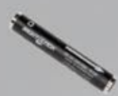
Spare Lithium-ion rechargeable battery