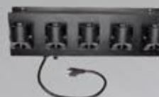
Five bank charger