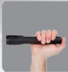
Tail-cap switch (NSR-9514B)