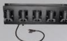
Five bank charger