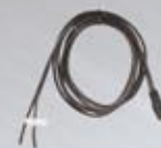
Direct wire kit

*Limited Lifetime Warranty • Product is warranted to be free from defects in workmanship and materials for the lifetime of the original owner. Includes the LEDs, housing, lenses, electronics and switches. Rechargeable batteries and chargers are warranted for a period of one year. Excludes normal wear and abuse.