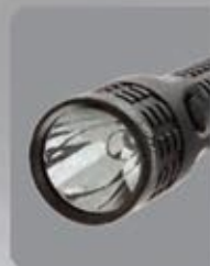
High-efficiency deep parabolic reflector