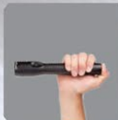
Tail-cap switch (NSR-9614B)