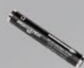
Spare Lithium-ion rechargeable battery