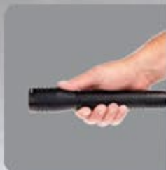
Body switch (NSR-9612B/14B)