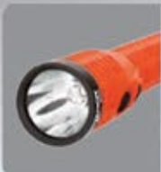
High-efficiency deep parabolic reflector