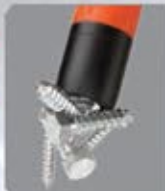
Hands-free tail cap magnet