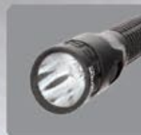
High-efficiency deep parabolic reflector