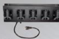
Five bank charger