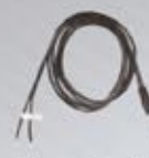
Direct wire kit

*Limited Lifetime Warranty • Product is warranted to be free from defects in workmanship and materials for the lifetime of the original owner. Includes the LEDs, housing, lenses, electronics and switches. Rechargeable batteries and chargers are warranted for a period of one year. Excludes normal wear and abuse.