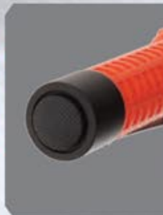
Large textured tail-switch