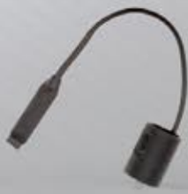
Remote Pressure Switch