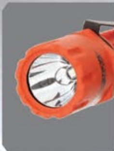
High-efficiency deep parabolic reflector