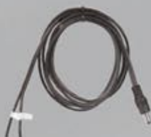
Direct Wire Kit