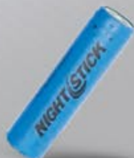
Spare Lithium-ion Battery