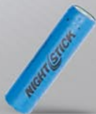
Spare Lithium-ion Battery