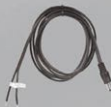
Direct Wire Kit