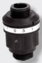
4064 For more information please see Pg. 12

The illustration at right shows a Scotty Foam Backpack System