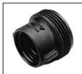
4082 (NHT) or 4083 (NPSH) Reducer Changes 1-1/2" thread down to 1".