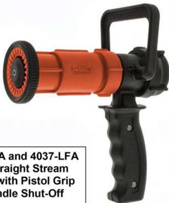
4037-HFA and 4037-LFA Fog-Straight Stream Nozzle with Pistol Grip D-Handle Shut-Off